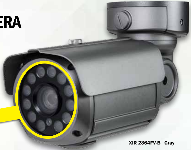
XIR 2364FV-B Gray