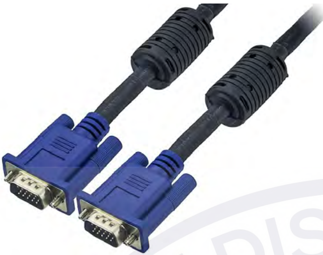
VGA port, view from Wire Side