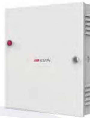
DS-K2604-G Network Access Controller