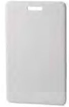
DS-K7M151-P Clamshell Proximity Card