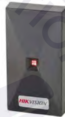
DS-K182HP Proximity Reader

Small businesses can use a tool called Hikvision DS-KIT4DRACP to control access for up to 25 employees. This kit combines three separate access control products into one comprehensive package, providing unbeatable value and convenience for business owners.