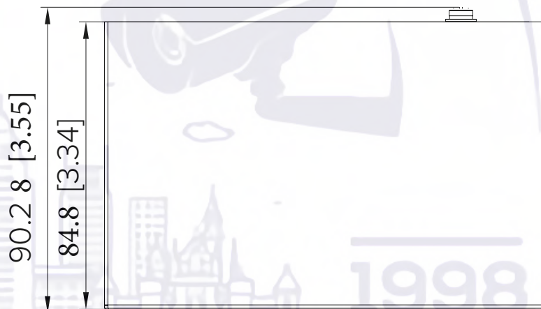
Dimensional Drawing MM[IN.]

Note: Data from this table was collected by Luminy Systems Corporation test lab and is for reference only. The actual transmission distance may vary due to power consumption of connected devices or the cable type and status.