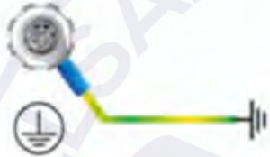
Figure 1: Socket-outlet protective earthing connection