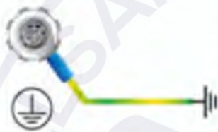
Figure 1: Socket-outlet protective earthing connection