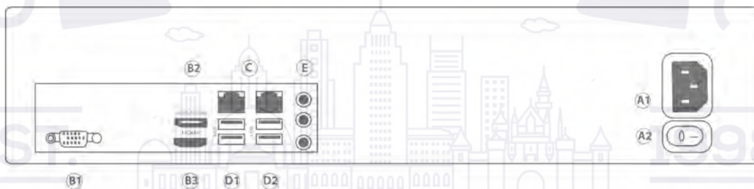
Figure 3: DTA-Series Hybrid Desktop back panel

For information about the back panel connections for the DTA-Series Hybrid Desktop, see the following information.