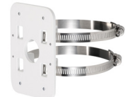
PFA152-E Pole Mount