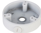
PFA137 Junction Box