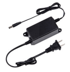
DH-PFM320D-US Power Adapter