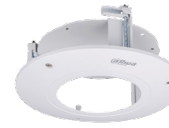
PFB200C In-ceiling Mount