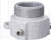
PFA111 Mount Adapter